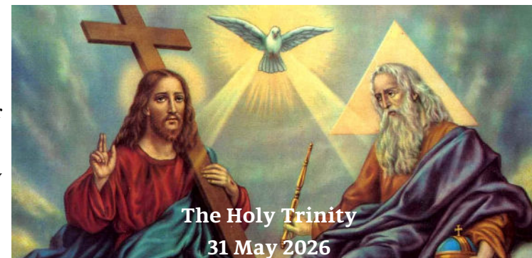
The Holy Trinity 31 May 2026

The Mystery We Profess : Today, the Church celebrates the central mystery of our faith: One God in Three Persons – Father, Son, and Holy Spirit. This is not a puzzle to be solved, but a reality to be lived. The Catechism tells us that the Trinity is the source and goal of our Christian life. Every prayer we make, every sacrament we receive, every blessing we give – all begin and end in the name of the Father, and of the Son, and of the Holy Spirit.