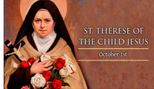
ST. THERESE OF THE CHILD JESUS October 1st