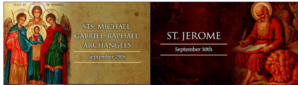
STS. MICHAEL, GABRIEL, RAPHAEL, ARCHANGELS September 29th

The hand, foot and eye in this teaching also represent every situation in life that tempts us to sin. For example, consider material possessions. If buying a very expensive car, house, or electronic gadget tempts you to become more materialistic, then you must avoid buying it. People are drawn to nice things. But does possessing nice things help your soul to become holy? One could argue that they can have nice things, while at the same time remain spiritually detached from them. But this is difficult to live. The more luxurious our material possessions, the more tempted we will be to rely upon them for our happiness. Therefore, choosing to live simply is almost always better for your soul than choosing to live in luxury. This teaching also applies to anything else that could become a source of temptation.