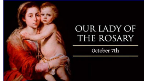
OUR LADY OF THE ROSARY October 7th