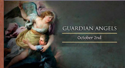
GUARDIAN ANGELS October 2nd